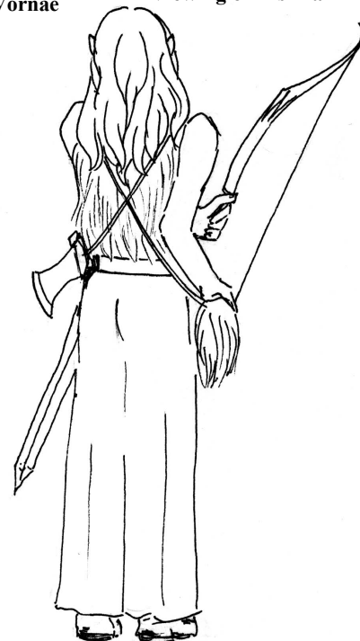
Wild Elf Redistributes Pouches for Better Viewing of His 'Tail'