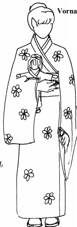
Vornae with Vornae doll.