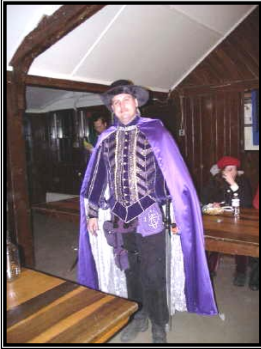
Best Dressed Noble Viscount Simeon Silvercord